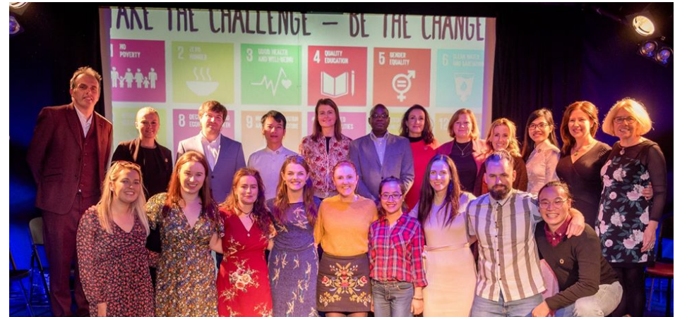
SDG Advocate Showcase 2019

The SDG challenge has different activities within the project with 2019 covering two different funding timelines. In short, over 20 workshops were held that directly engaged over 650 people across the country. These workshops included work with Public Participation Networks and Further Education Institutes. A core part of the project is the SDG advocate training. The 2019 edition saw 10 people complete the intense eight month course. The advocate training culminated in a study visit by four of our colleagues from CSDS in Vietnam for a series of public events and a showcase event in the Spirit store in Dundalk.